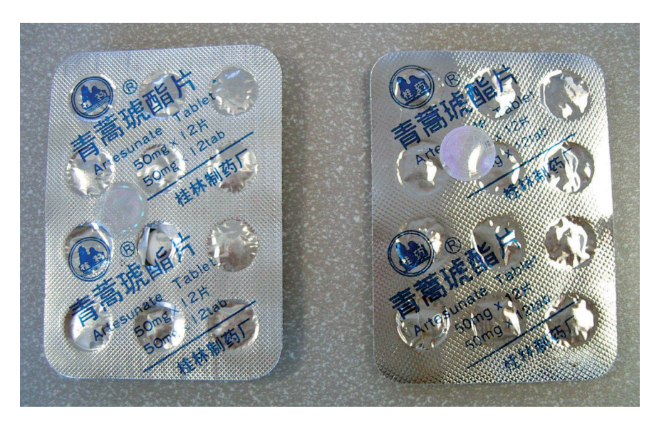
Can you tell which one is fake?

and collection of appropriate evidence for prosecution.