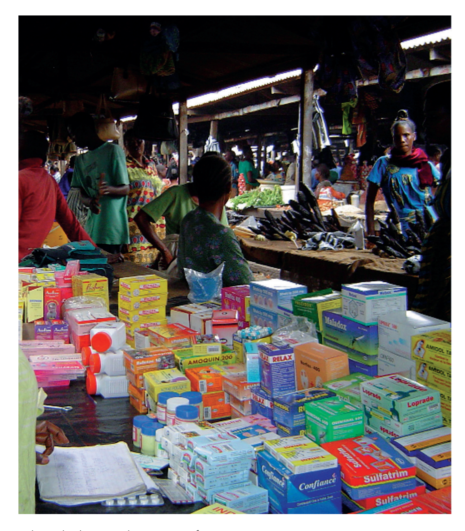
Where do these medicines come from?

By working with the World Customs Organization, INTERPOL, and informal networks of enforcement officers, the Permanent Forum on International Pharmaceutical Crime, IMPACT offers an important opportunity for improving contact and mutual understanding among enforcement officials of different countries in order to improve coordination of operations and exchange of information. IMPACT is also a tool for enforcement officers to establish communication with health authorities and other stakeholders. The enforcement working group is working also at developing training materials for enforcement officers of countries that need to improve their technical skills in the detection of suspected counterfeits