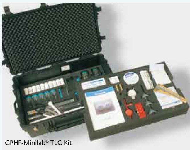
GPHF-Minilab® TLC Kit

GPHF-Minilabs contain the essential lab ware and chemicals, as well as authentic tablets and capsules for reference purposes. Supplies include sufficient quantities in order to perform about 1000 assays while ensuring that the total material costs for one test run do not exceed two Euros. Two suitcases contain the essential components - a full range of glassware for sample extraction, preparation, pipetting and spotting, high performance chromatographic plates, developing and detection chambers, UV lamps with different wavelengths, a hot plate, a spirit lamp, test tubes, caliper rules and storage containers. Even pens and pencils are included. If needed, a digital pocket balance can easily be added. Of particular importance is a full collection of authentic secondary reference standards for more than forty active ingredients and a set of manuals providing simple operation procedures. Written in a non-scientific format and rich in illustrations, the manuals read more like a cooking recipe than an instruction booklet; they are also available in French and Spanish.