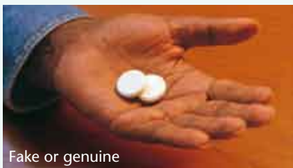
Fake or genuine

On the consumer level, counterfeit money or fake watches, jewelry, and software may still be detected with the naked eye. This does not apply to medicines where the final consumer usually cannot distinguish between good and bad medicines. Due to this and to the widespread danger of counterfeit medicines, quality control in the distribution systems of developing countries has taken on a broader role today. If adherence to