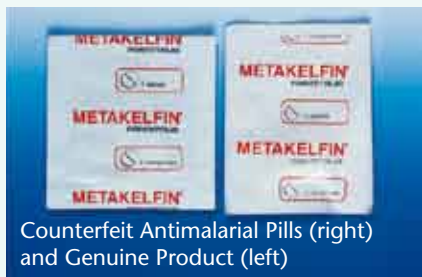
Counterfeit Antimalarial Pills (right) and Genuine Product (left)

manuals printed in different languages, but also a complete range of lab ware, starter kit chemicals and reference standards - all suitably packed for global shipment by air. Now, counterfeit medicines containing wrong, too little, or no ingredients at all can be identified instantly anywhere in the world. Results obtained by a set of physical and chemical screening tests must match the product label claims for, at least, drug identity and content. If they do not match or results are inconclusive, then the appropriate batches can be frozen for further investigation. GPHF-Minilab tests cannot replace extensive testing on questions of drug release, chemical purity, or microbial burden; those and detailed forensic testing for court actions must be referred to a comprehensive